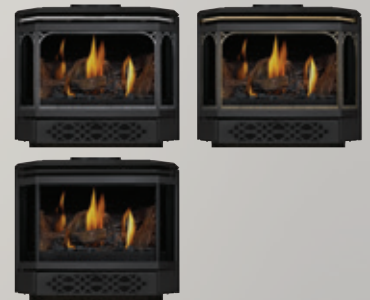
CHROME, GOLD OR BLACK DOOR AVAILABLE