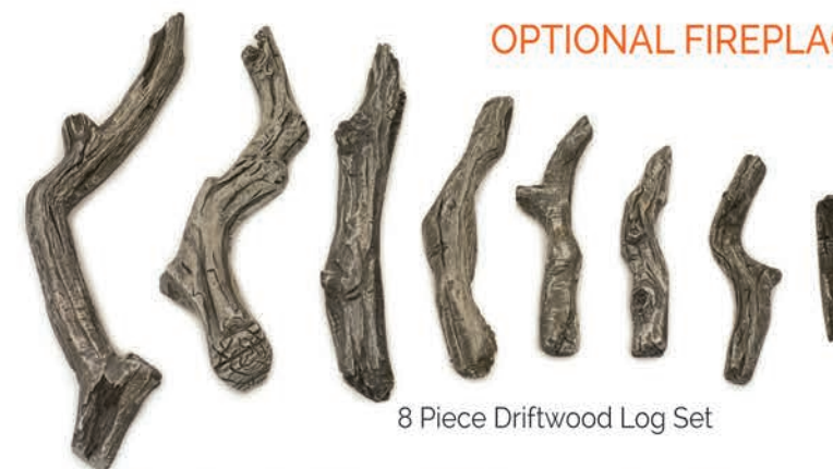
8 Piece Driftwood Log Set