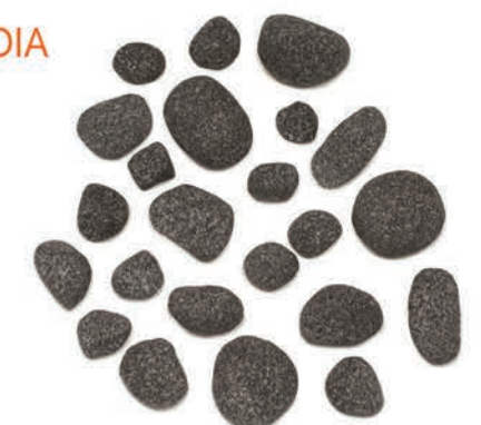
River Stone Pebbles