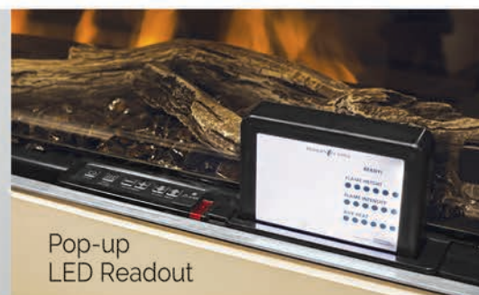
Pop-up LED Readout