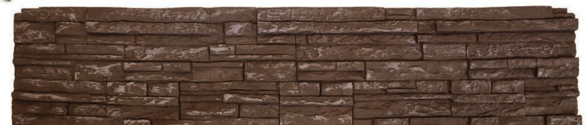
Ledgestone Back Brick