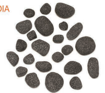
River Stone Pebbles