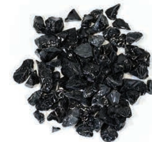
STANDARD MEDIA Black Glass Chip Ember Bed